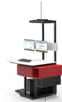
Minimal waste & job setup time Correct and consistent colors 100% variable print in full color and B&W