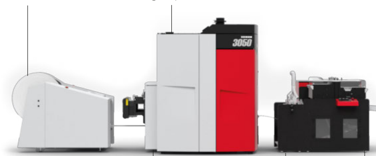
QB-I dry-toner technology CMYK & spot colors